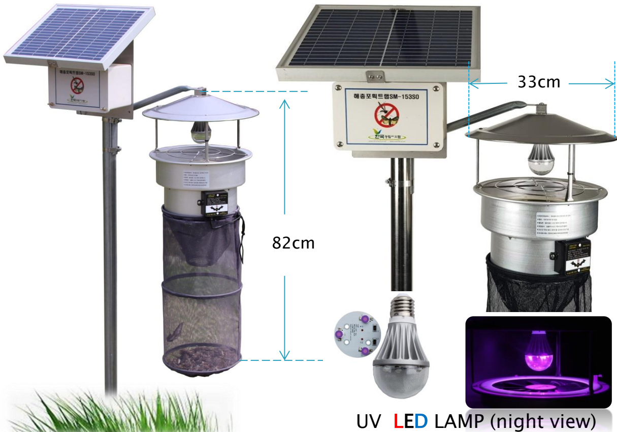
UV LED LAMP (night view)

Reduce Bird in Airport to cut the food chain of the Bird's feed.