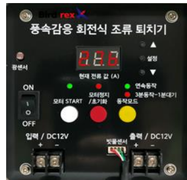
Main controller (wind speed, rain, Motors)